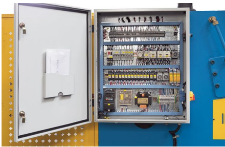
High-quality electric components for maximum reliability