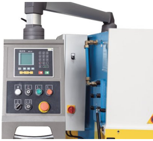
NC control for quick positioning of the back gauge