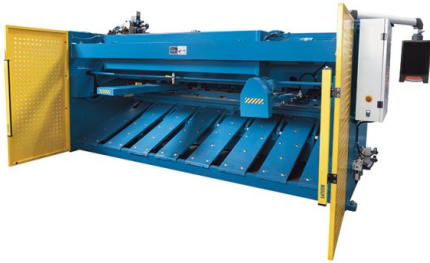
With the pneumatically controlled plate hold-up fixture even thin metal sheets can be positioned with high accuracy at the back gauge