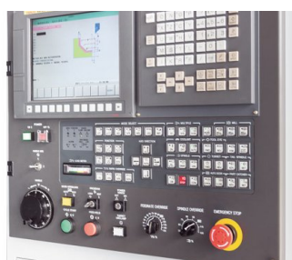
Control Fanuc Oi-MF