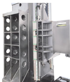
Cast iron body with large span