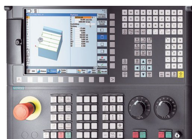
Control Siemens Sinumerik 828D