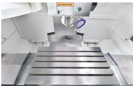
Solid machine table with 5 slots