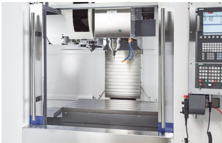
Wide opening front doors