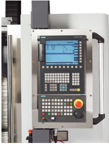
Siemens Sinumerik 828D with ShopMill