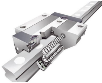
Linear-roller guides for super quiet operation