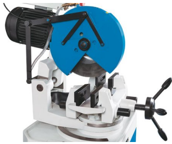
KKS 315 T