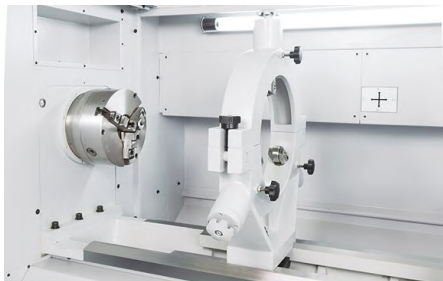
Option: steady rests up to 400 mm diameter