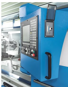
Interface for data transmission, swivelling control operating unit