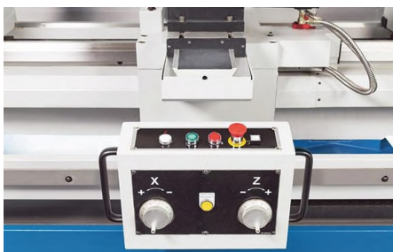
Compact control unit with electronic hand-wheels