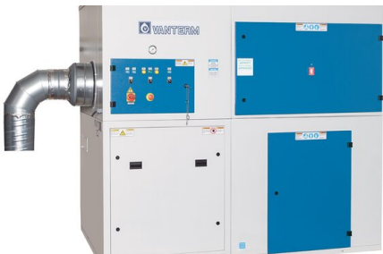
Filter system with HEPA 14 filter and W3 certified dust separation (Fig. for 6 kW)