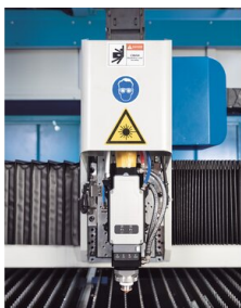
Cutter head with integrated collision guard, automatic focus positioning, and height control