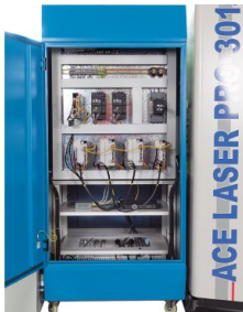
Well-organized design and careful selection of components guarantees consistent trouble-free function