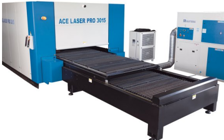
An automatic changer table system minimizes down-times by allowing simultaneous loading and unloading of the table during the cutting process