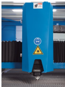
Smart cutter heads of the BLT 6 series also were custom designed for high-power laser cutting systems with max. 40 kW power