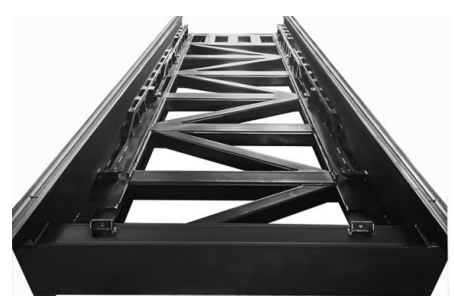
The frame is meticulously welded and thermal treated

Automatic exchange table system with light safe system