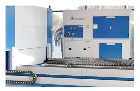
Machine comes standard with a dust collector and filtration unit and has 99,997% filtration efficiency