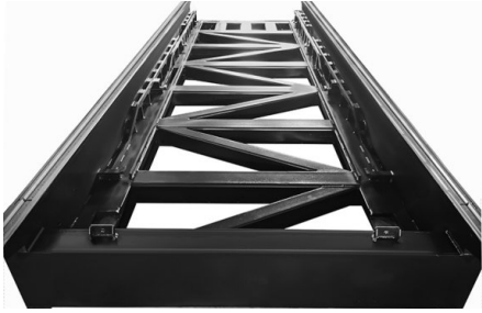
The frame is meticulously welded and thermal treated