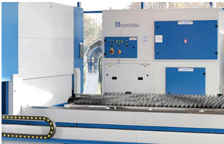
Machine comes standard with a dust collector and filtration unit and has 99,997% filtration efficiency