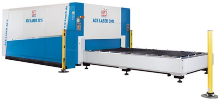
Automatic exchange table system with light safe system