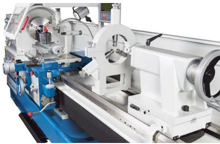
Rests ensure maximum precision when machining long workpieces