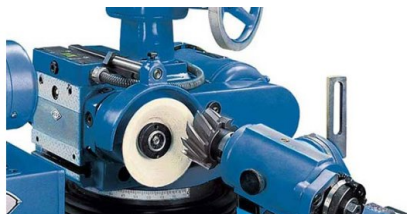
Rigid angle-adjustable workpiece mounts