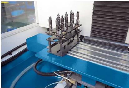
Tool holder with 4 positions