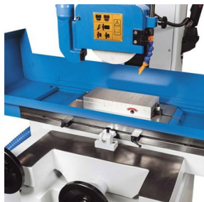
Permanent magnetic clamping plates with micro pole pitch - ideal for high-precision grinding work