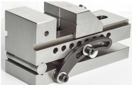
Angle-adjustable grinding vise (standard equipment)