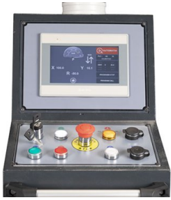
Intuitive controller with large touchscreen and three operating modes: manual/semi-auto/automatic