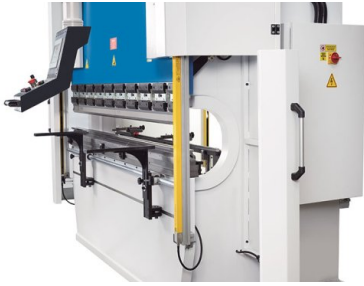
A large throat and narrow table to ensure plenty of free space for complex bending