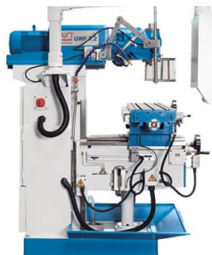
Large throat and long travels