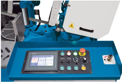
The touchscreen allows for easy and convenient programming for fully automated operation