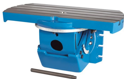
Universal swivel table for FPK 4.3/ FPK 6.3 (253721)