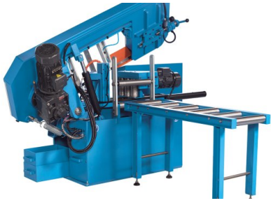
A motor with infinitely variable speeds transmits power via a continuous-operation idler gear to the machine drive wheel