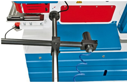
Back gauge with automatic cut activation

• Models HPS 45H and HPS 60 H feature a powerful hydraulic cylinder • Models HPS 65 H, HPS 85 H, HPS 115 H and HPS 175 feature 2 hydraulic cylinders allowing simultaneous operation at 2 stations