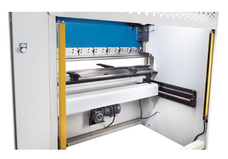
The rear side is protected by light curtains

Intuitive controller with large touchscreen and three operating modes: manual/semiauto/automatic