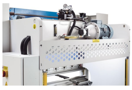
Hydraulic unit positioned on the top of the machine for extra bending space.