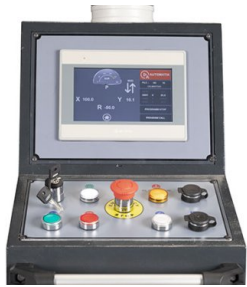
Intuitive controller with large touchscreen and three operating modes: manual/semi-auto/automatic