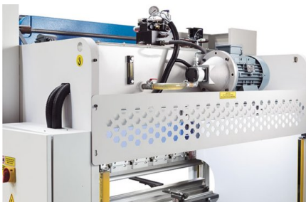
Hydraulic unit positioned on the top of the machine for extra bending space.