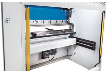
The rear side is protected by light curtains