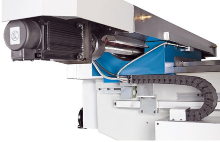
High precision ball-screws