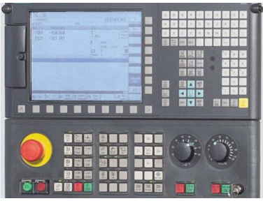
Siemens Sinumerik 828 D - a compact and user-friendly solution for lathes