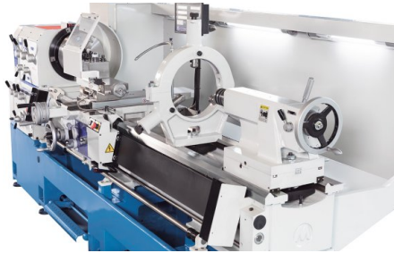
Large diameter steady rest included with standard equipment; illustration shows machine with optional equipment