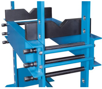
The table is fixed inside the gantry with 4 massive safety bolts